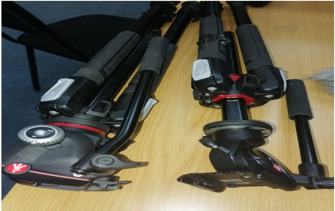
Manfrotto tripod x6 units