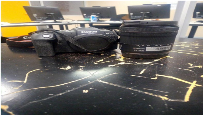
2. SONY 7C Camera and Lense X 4 units