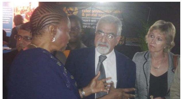
The DTPS Deputy Minister with some of the Directors of the e-Skills CoLabs.

NEMISA and its CoLabs were part of the exhibition that was part of the Budget Vote to parliament on 10 May 2016.