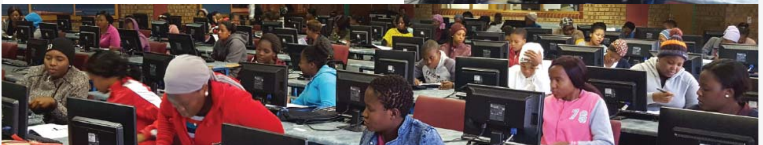
Participants at the Intel Easy Steps course conducted in November and December 2015.