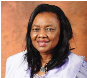
Deputy Minister of the Department of Telecommunications and Postal Services, Prof Hlengiwe Mkhize

In her speech to parliament for the DTPS Budget Vote on 10 May 2016, Deputy Minister of the Department of Telecommunications and Postal Services, Prof Hlengiwe Mkhize, talked around the theme 'Accelerating Broadband Access for Ordinary Citizens'. Following are some of the focus areas, in particular those that refer to e-skills (digital skills).