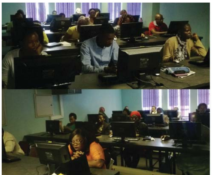
Delegates from one of the five courses run from April to June 2015. The e-literacy training was for Limpopo health workers.